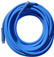
Bluflood hose. hose L= 20mt. S/s Crimped 1/2" female Code 18262/FFX/20000