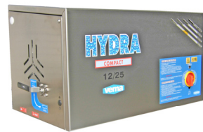
Wall mounted version