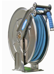
S/s automatic hose reel (without hose) Code 10500 (Section 50)