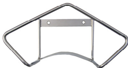
S/s wall holder for hose Code 20903