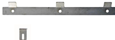
S/s mounting bracket Code 33011+ Code 33012