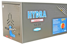
Wall mounted version